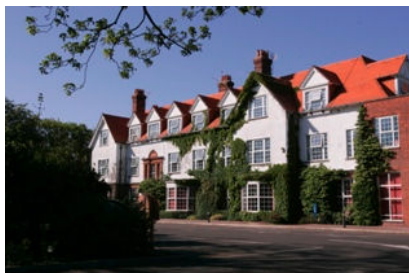
The Secondary Department Margate